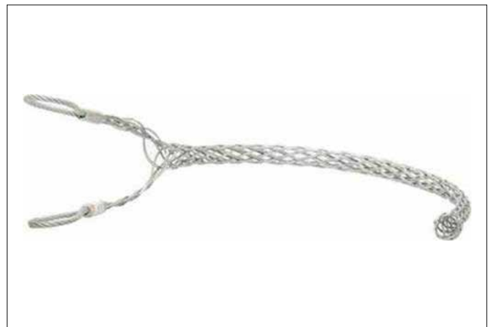
Wire cable stocking: "Secure hose sleeve"